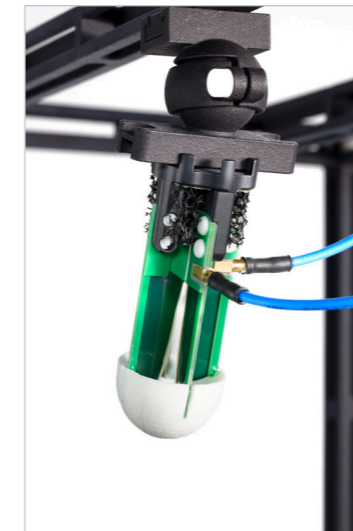
Rohde & Schwarz provides a wide variety of antenna types that serves different functionalities in OTA systems. Vivaldi antennas are particularly suitable for use in R&S®CMQ shielding cubes.