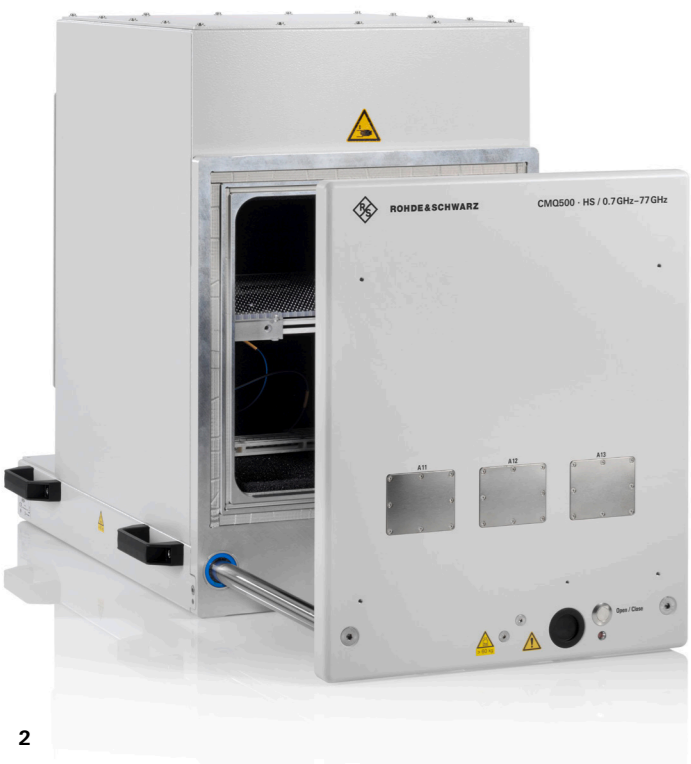
The R&S®CMQ500 with open door. R&S®CMQ models are available with a manual or automatic opening/closing mechanism.