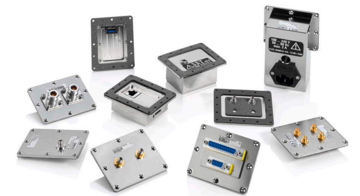
Multiple power, control, communications or coaxial RF feedthroughs are available.

Modern devices now offer many different wireless connections but often come with a USB3 wired interface. The R&S®CMQ can be equipped with a USB3 feedthrough and cable with an A/B type connector or with a more modern C type connector. If different kinds communications, power or control cables are required at the DUT, the R&S®CMQ can be equipped with a dozen additional feedthroughs to run cables in the shielded chamber without compromising the effectiveness of the shielding.