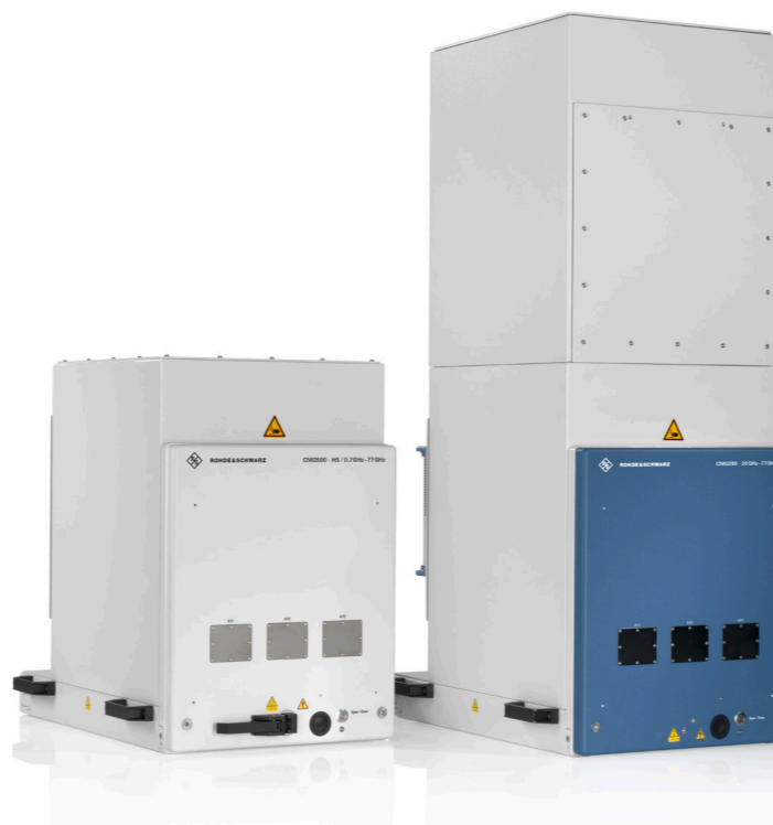
Height extensions can double the distance between the DUT and the measurement antenna.

The R&S®CMQ is compact enough to fit into 19" racks and enable over-the-air RF measurements under direct far field conditions. The resulting quiet zone is big enough to fit for medium-sized devices and enables white box measurements, where the location of antennas inside the DUT are known. If a larger quiet zone is needed, an optional height extension can increase the distance between measurement antenna and DUT for reliable RF measurements within the Fraunhofer distance.