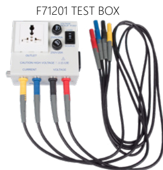
F71201 TEST BOX