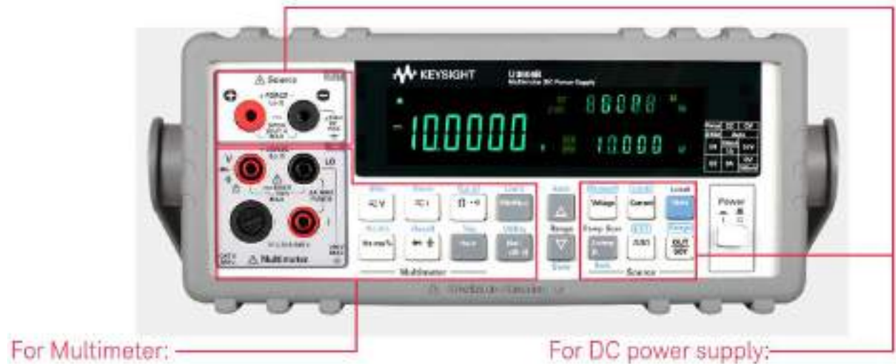
Figure 3. Front panel of the U3606B.