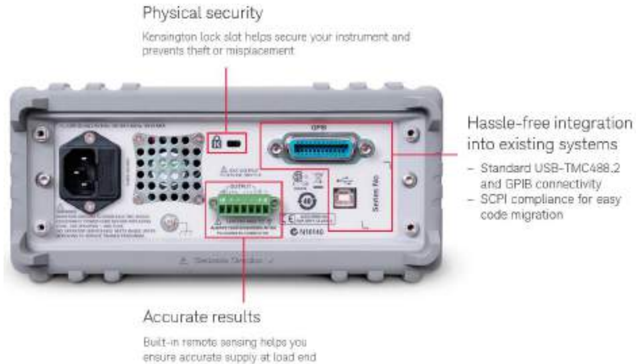
Figure 4. Rear panel of the U3606B.